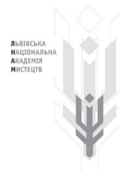
Lviv National Academy of Arts