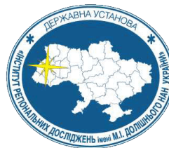
Institute of Regional Research named after M.I. Dolishniy of the NAS of Ukraine