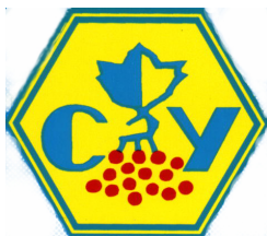
NGO «Union of Ukrainians»