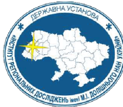
Institute of Regional Research named after M.I. Dolishniy of the NAS of Ukraine