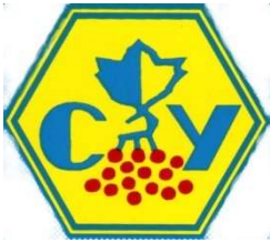
NGO «Union of Ukrainians»