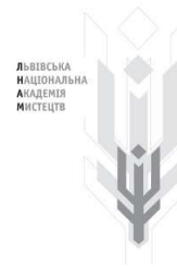
Lviv National Academy of Arts